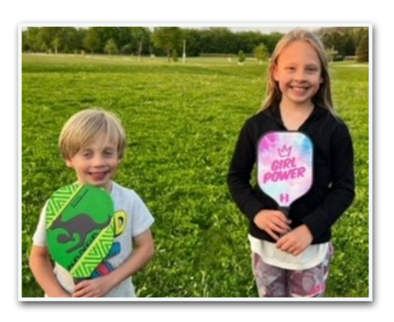
The future of Pickleball...is now 🥹