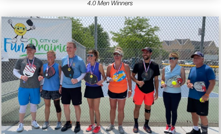
4.0 Mixed Doubles Winners