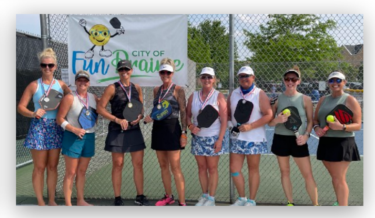
4.0 Women Winners