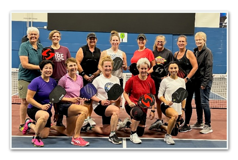
Group Play at Pickle Pro Courts