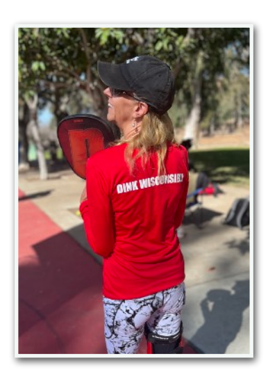
Representing CAPA in San Diego