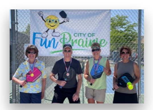
Flight 3 Winners