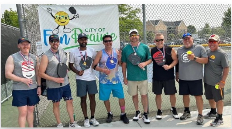
3.5 Men Winners

Have pictures you want to share? Send them our way: