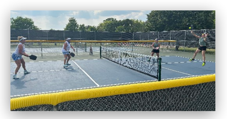
Fun Prairie Open in Action