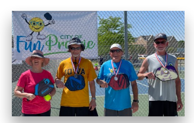
Flight 2 Winners