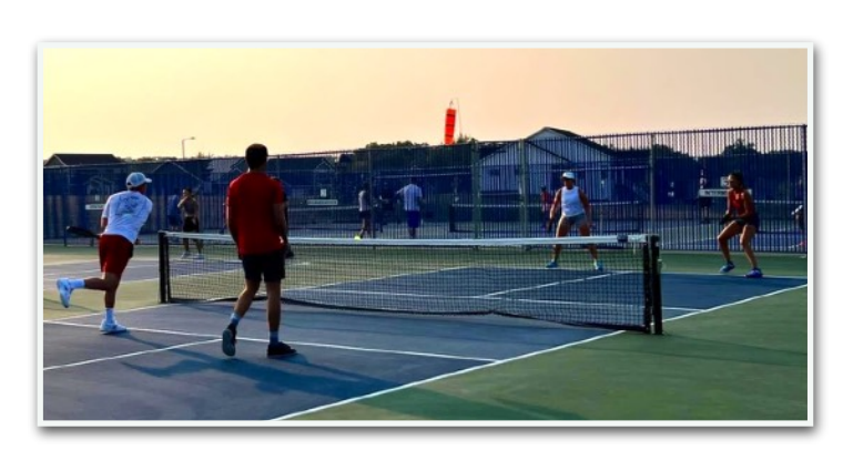
Pickles and Beer Social Play at Sunset at McGaw Park