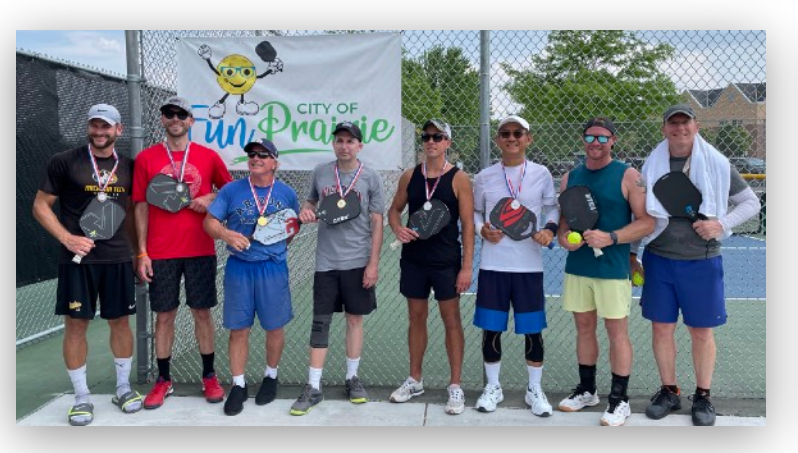
4.0 Men Winners