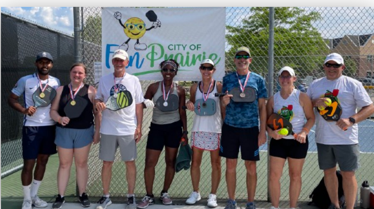
3.5 Women Winners